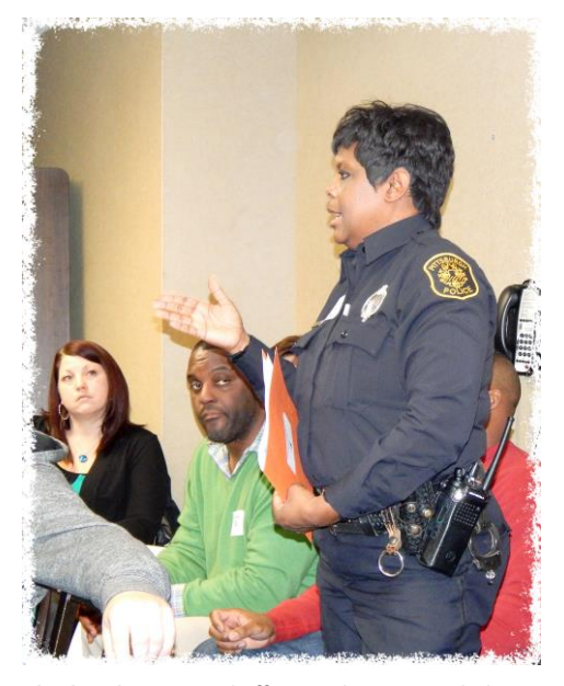
Pittsburgh, PA - Local officer explains to youth the fear and dangers that police face daily on the street

To reduce the number of volatile interactions between youth and officers on the street, to decrease arrests of minority youth, and to diminish the chance of injuries to officers and youth on the street.