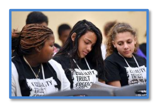
Female students wear T-shirts given to youth at the Youth/ Law Enforcement Forum

Now, he takes part in the Bench Mark Program, a Lancaster-based program that helps at-risk youth kids through fitnessbased mentoring.