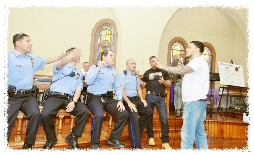
Philadelphia, PA - Young man engages in a role-play with local police officers where he portrays an officer tasked with directing local teens (played by officers) to clear an elderly resident's stoop after a noise complaint