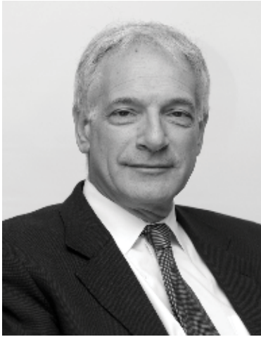
Robert Gallucci President MacArthur Foundation